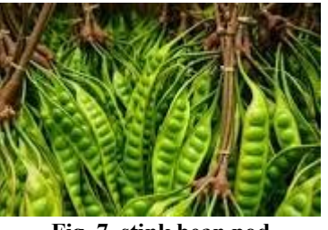
Fig. 7. stink bean pod

Arkia speciosa is known as stink bean or "sator" in Thailand and "petai" in Malaysia as shown in Fig. 6 It bears long and flat beans pod with green seeds. These beans are popular in Southeastern Asia including the south of Thailand, Malaysia, and Northeastern India. These pods are regarded as waste material