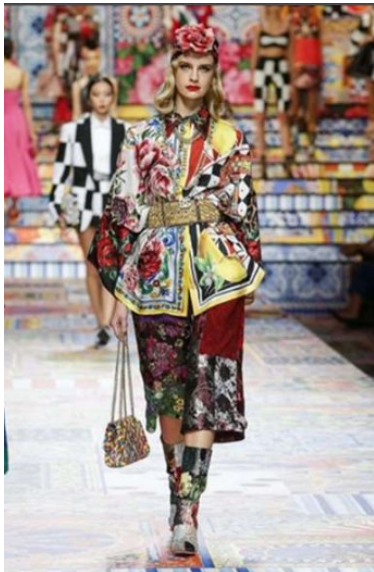
Figure 2 An illustration of patchwork in Sicily

historical events or to depict their family history. The industries underwent a shift in the 1960s, from traditional crafts to modern crafts, as a result of the counter-cultural groups that emerged in California, including the hippies, who were the popular culture revivalists. The outcome of this change was the rebirth of domestic industry. Additionally, the way that young people approached clothing and coverings changed dramatically from before, and the process of turning forty-piece handicrafts into what is now known as an art quilt in America was developed in the years following World War II.