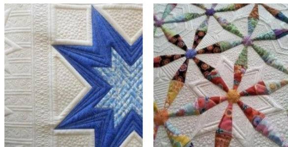
Figure 3 Patchwork of texture and beauty

Patchwork art underwent constant reconstruction and change, which not only considerably expanded the categories of textiles but also preserved old patchwork techniques while adding new ones, adapting patchwork art to the demands of the times and fashion trends.[20]