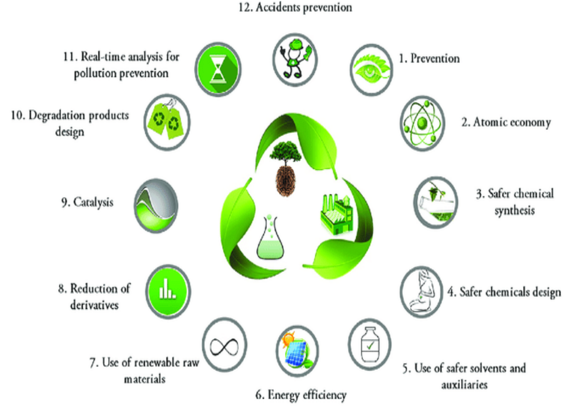
Figure 1: Green Chemistry Principles that Anastas and Warner (Anastas and Warner, 1998) proposed.[19]

cellulose is one of the most prevalent natural polymers in the world. It has the potential to be a source of environmentally beneficial and biocompatible products because it is renewable, biodegradable, and non-toxic. It comes from a variety of sources, including bacteria, cotton, grass, blast fibers, wood, and tunicates, with wood being the main source of cellulose. One of the various sources of cellulose is pineapple leaf.[9, 11-18]