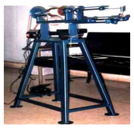
Figure (6): Junta[48]

Subsequently, PALF must pass through the fiber cut and opener system to cut the fiber to the appropriate length. Only extremely soft and fine fiber will be chosen at the end. After that, the chosen fiber can be spun using a modified cotton spinning technique. Carding, drawing, and ring spinning are steps in the spinning process. In addition, more research is required to determine how fiber characteristics and linear density affect the hairiness of PALF yarn in the spinning system. Yarn hairiness is influenced by a number of factors.