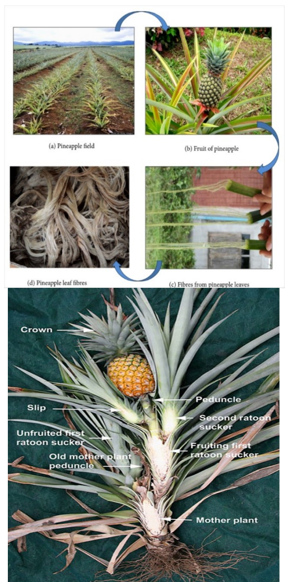
Figure (4): Production of pineapple leaf fiber involves the following steps: (a) pineapple plantation, (b) pineapple fruit, (c) pineapple leaf fiber extraction, and (d) Indonesian PALF.[35]

It has been shown that the microfibrillar angle of 14 in pineapple leaf fibers (PALF) leads to a reduced elongation. Traditionally, the outer layers of pineapple leaves are scraped off in order to hand harvest the fibers. In the past ten years, approximately 35 kg of fibers may be processed by decorticating machines in an eight-hour shift[34]. The process of extracting fibers from pineapple leaf fiber involves both mechanical and retting methods. About 2 to 3% of fibers are generated by fresh leaves.